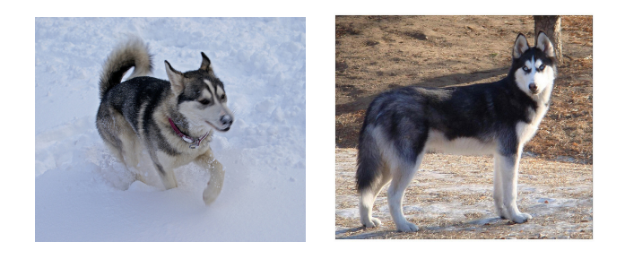
Figure 1: Two distinct classes from the 1000 classes of the ILSVRC 2014 classification challenge. Domain knowledge is required to distinguish between these classes.

The most straightforward way of improving the performance of deep neural networks is by increasing their size. This includes both increasing the depth – the number of net-